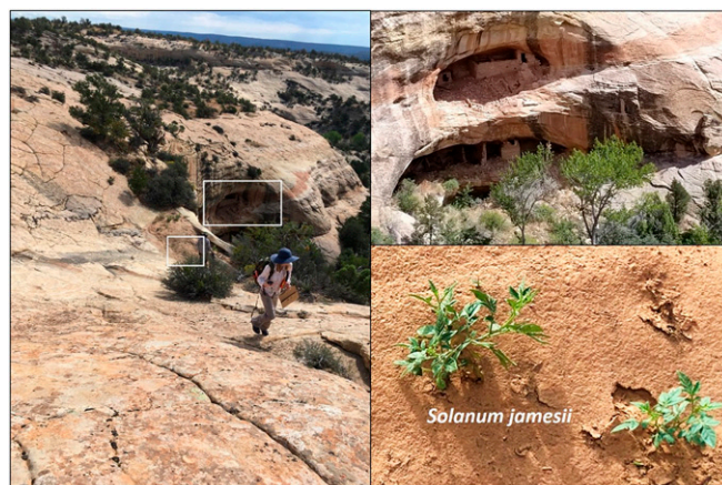
Fig. 3. Four Corners potato ( Solanum jamesii ) growing in sand at the base of slick rock waterfall, just above site 425A244, a two-story cliff dwelling in Bears Ears. The species reproduces only by tubers that have very limited dispersal capability. The situation repeats itself among archaeological sites in southern Utah, Arizona, and New Mexico.

In addition to the significant relationship between the number of architectural features and high ESR, the model predicts that sites with high ESR tend to be located in the central region of Bears Ears as well as on Cedar and Mancos mesas (Fig. 1 and SI Appendix, Fig. S8 ). Our model identifies specific locations within Bears Ears that will require special management regimes, especially in light of increased visitation and the proposed development or expansion of resource extraction activities in the recently downsized national monument. Those special regimes should be cross-cultural, developed with tribal input (44, 62, 63), to emphasize the conservation and restoration of archaeo-ecosystems that contain “high priority” plant species, especially those held sacred as lifeway medicines. It is likely that such rare or uncommon